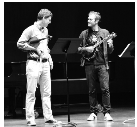
ABOVE: A crowd gathers at Volunteer Park for Chamber Music in the Park; James Ehnes, violin, Chris Thile, mandolin