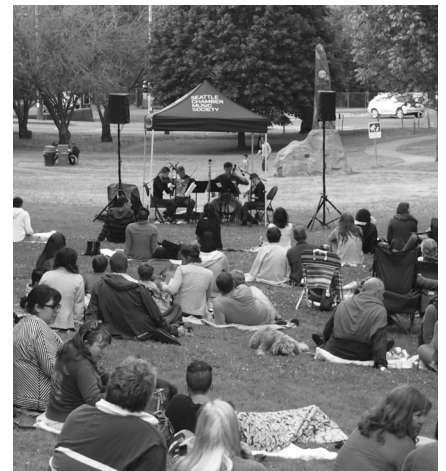
ABOVE: Music Under the Stars at Columbia Park