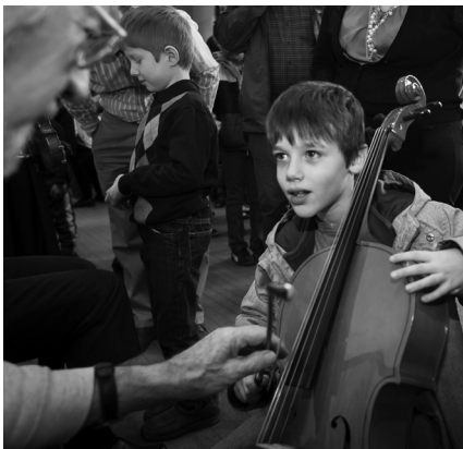
ABOVE: Students take part in the musical instrument "petting zoo" at the Family Concert

78% NEW AUDIENCE MEMBERS ATTENDING MUSIC UNDER THE STARS