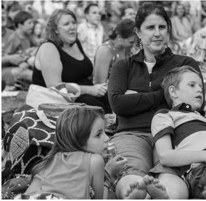
ABOVE: Crowd members listening to Chamber Music in the Park performance

We sat on our blanket and we saw an amazing string quartet, and it was such a beautiful thing to be here in my neighborhood park, so inspirational. It made me feel so good to see a beautiful concert, and now to hear the concert from Benaroya. I'm just so grateful. Thank you so much.