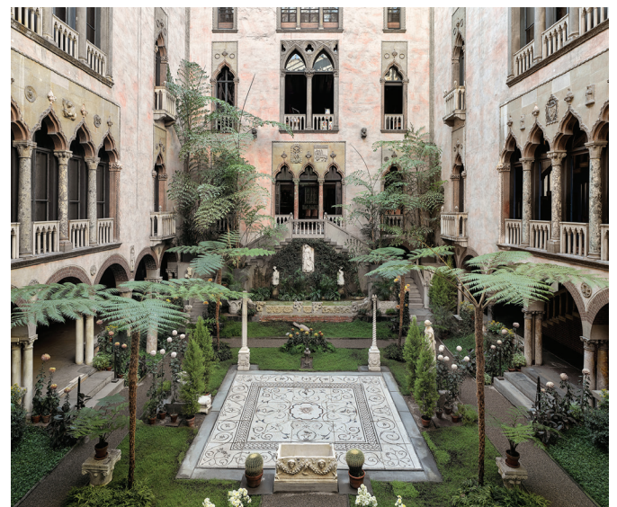
Courtyard at Isabella Stewart Gardner Museum