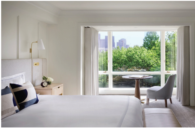
Taj Boston, Park View, King Room