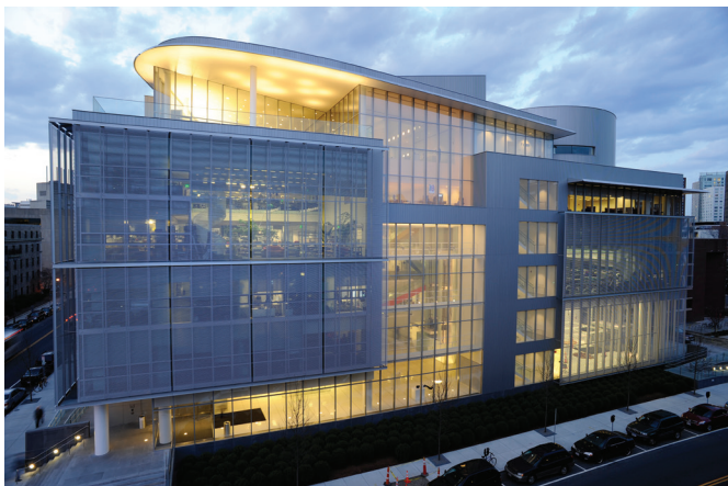
MIT Media Lab

For over 30 years Media Lab researchers have anticipated and created technologies to make our lives safer, cleaner, healthier, fairer, and more productive. But along with benefits, technology's everyday efficiencies have also brought their share of issues: obesity, poverty, ethical implications, bullying, divergent politics. The Media Lab's antidisiplinary research community is uniquely equipped to address these concerns, leveraging the best that technology has to offer, and connecting technology back to the social and the human. Current Lab research examines the deeper implications of where technology creation and adoption has led us—and where we want to go next. The Opera of the Future group (formerly known as Hyperinstruments) explores concepts and techniques to help advance the future of musical composition, performance, learning, and expression.