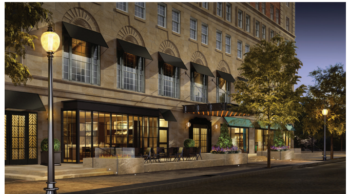
Taj Boston

As plans unfold, it is anticipated that a visit to New England Conservatory and Boston Symphony Hall will be added, as well as an end of tour group discussion.