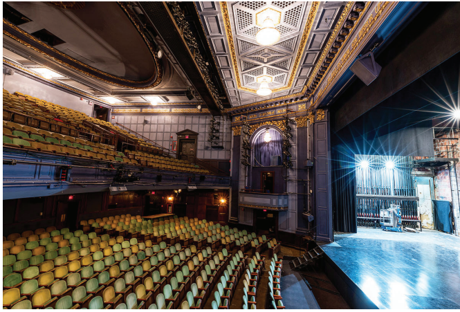
Huntington Theatre Company