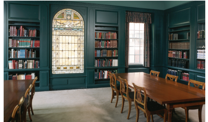
Spalding Room, Isham Memorial Library

5:00pm Solo Recital by MIT scholarship student in Killian Hall. Further information closer to date.