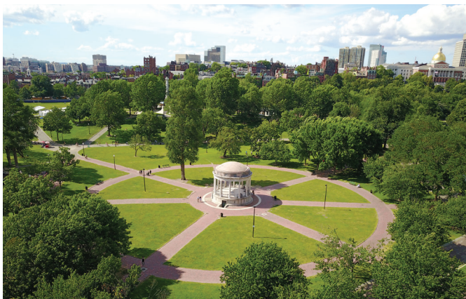
Parkman Bandstand, Boston Common

Independent departures. Car service airport transfers may be arranged by individual request.